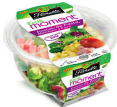
Figure 2. Technology applied in fresh-cut products

Magazine and Publications Santiago de Chile, 2016