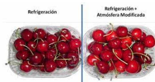
Figure 1. Controlled Atmosphere Storage of Fruits and Vegetables

Fernández y Martínez (2016) explain that according to the humidity of the cold storage room where the horticultural products are stored, the gradient with respect to the humidity of the product can be higher or lower, thus affecting the transpiration of the products consequent to the loss of turgidity and desiccation. The temperature and humidity of vegetables for storage is 2 °C with 95% relative humidity. It is important to keep in mind that humidity favors the growth of molds and yeasts if there is no adequate air circulation. Rodríguez (2013) In carrots the optimum relative humidity for storage is 98 to 100%, and 90 to 95% humidity in tomatoes.